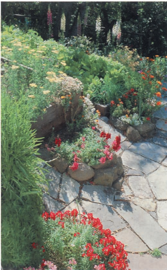
Figure 1.10 The Kelleys' landscape, viewed from their dining room. The rounded area at the end of each terrace is planted with seasonal flowers to add color and to soften the look of the wooden beds.