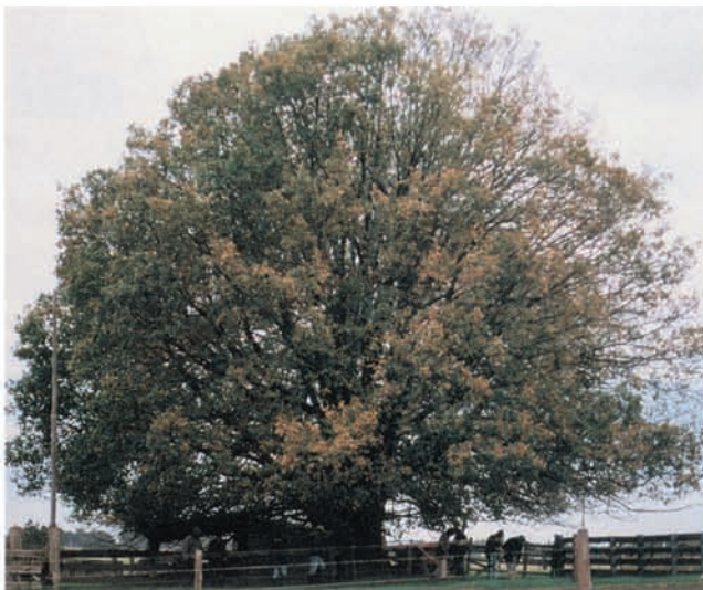
Utility: Portugese oak ( Quercus lusitanica ) planted over pig yards. Acorns are stock feed. Tree is semi-deciduous. Manjimup, Western Australia.