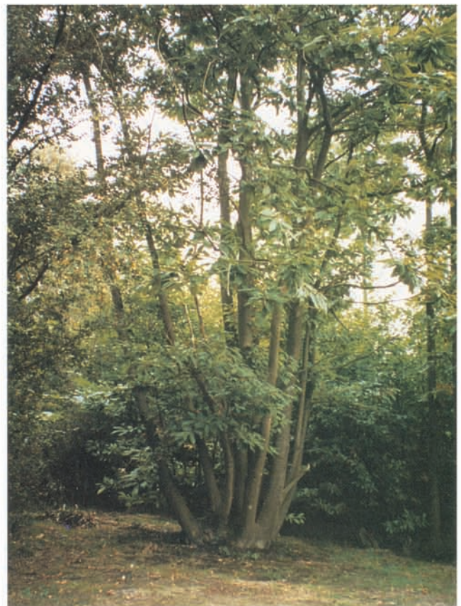
Nuts: chestnut coppice. The root system is well established and allows quick recovery and growth. Sussex, England.