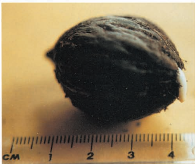
Utility: Quito palm ( Parajubaea coccooides ) Seed from Quito, Ecuador. Seed can take 18 months to germinate. Note sprout on the right of seed. The nut has the flavour of coconut. Nannup, Western Australia