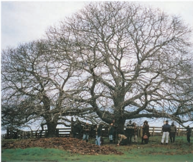
Nuts: chestnut tree ( Castanea sativa ). Manjimup, Western Australia.