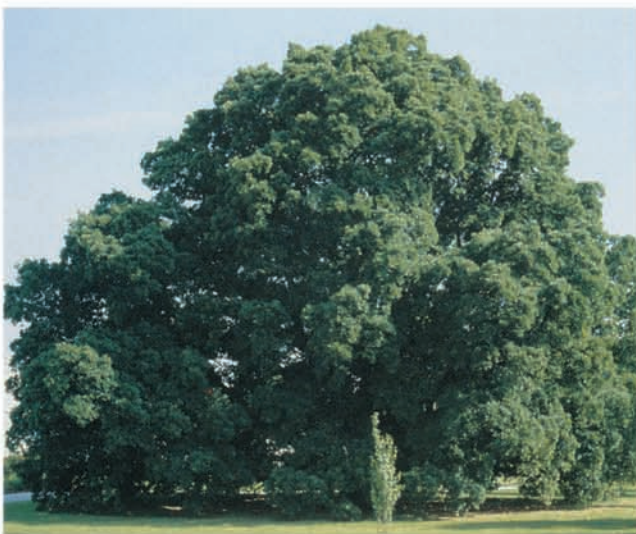
Holm oak ( Quercus ilex ). Acorns are eaten by stock and humans. It is a very hardy, evergreen, fire retardant. Kew Gardens, England.