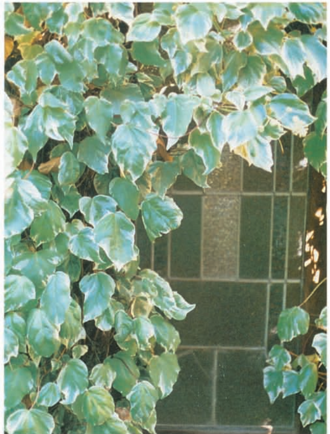
Ivy ( Hedera sp. ). Planted over building to insulate and protect from fire. The door leads to the office where most of this book was created (using solar electricity). Nannup, Western Australia.