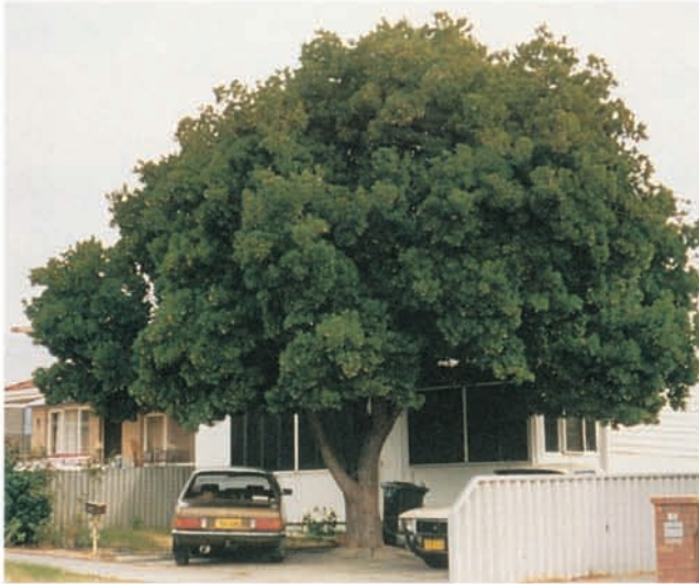
Fruit: Irish strawberry ( Arbutus unedo ). Can also be maintained as an evergreen hedge. Perth, Western Australia.